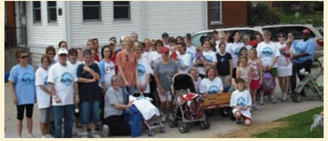
Participants in the Madonna House/Quanada fundraising and food drive walk.

Law enforcement is often first on the scene in most domestic violence and sexual assault cases. They will say that these cases can be difficult and dangerous to respond to. Good training is essential for the safety of the victim, the safety of the officer and to encourage a positive outcome for the case. Quanada recently provided domestic violence and sexual assault training to all law enforcement in Pike County and the Quincy Police Department in Adams County. We would like to thank all area law enforcement for their commitment to keeping victims safe while holding perpetrators accountable for their crimes!