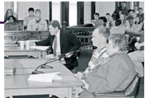
Participants in the Pike County Mock Rape Trial.