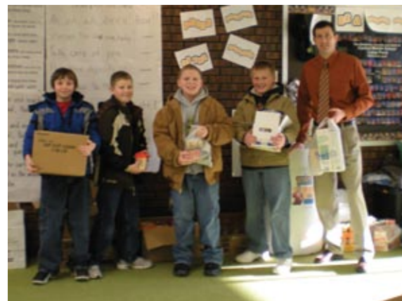
Students at the Central Middle School collect food for the Souperbowl of Caring.

Quincy Catholic Charities, Two Rivers and Quanada staff got together over a year ago and began talking about a combined food drive for our respective food pantries. We all were experiencing the same trend – increasing